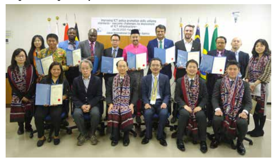
Figure 4: Closing Ceremony

The ITU-AJ intends to further enhance this training course, to increase its value and make it more meaningful, by making improvements in the programs for the next year and beyond.