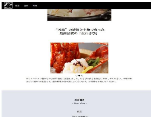
Web page in Japanese