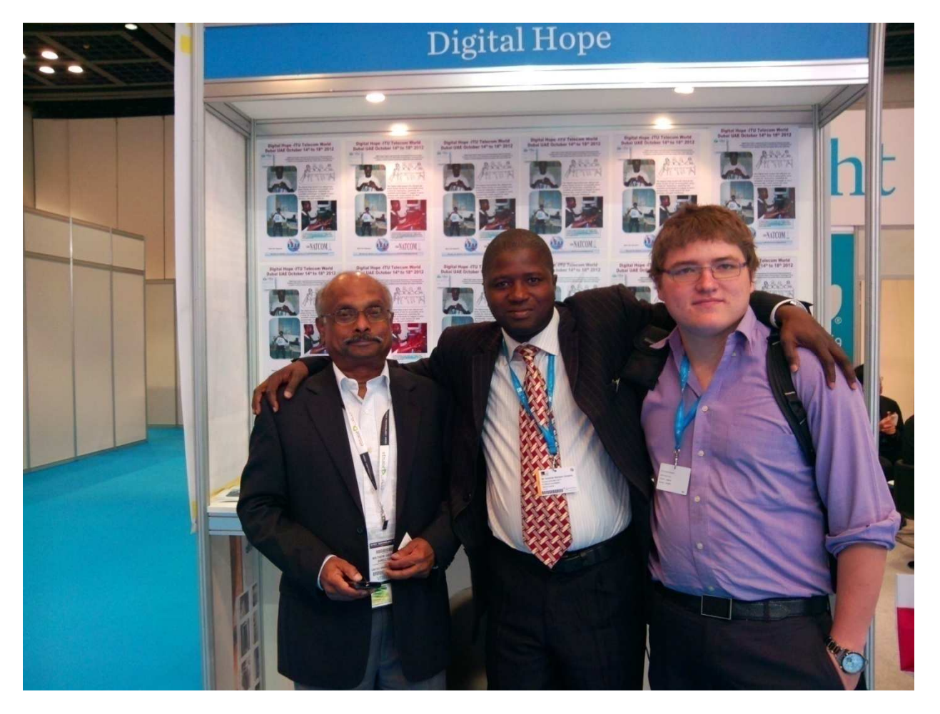
Digital Hope InnovatatorSpace. The exhibit was